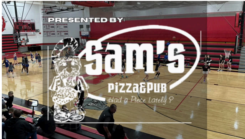
full screen ad example:

Displayed during unique ad read to open broadcast