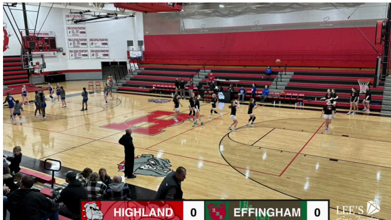
Bottom Right Corner Ad displayed throughout game

Displayed during unique ad read to open broadcast